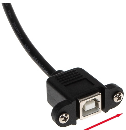
30mm Schraubenabstand screw distance distance entre les vis