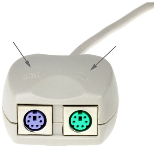
PC 99 Standard (Colors)