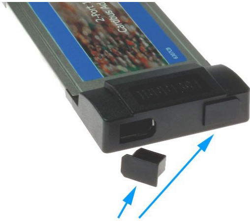
Kappe cap capuchon