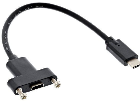
C männlich C male