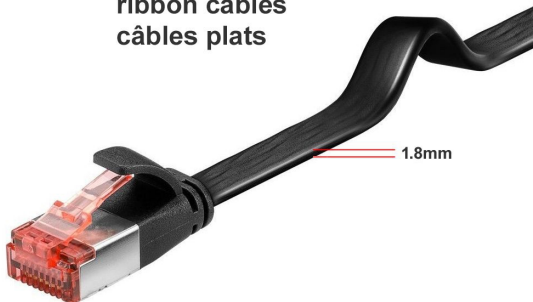
Flachkabel ribbon cables câbles plats